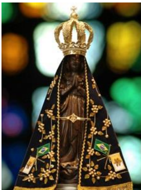
May 11: Our Lady of Aparecida, Patroness of Brazil