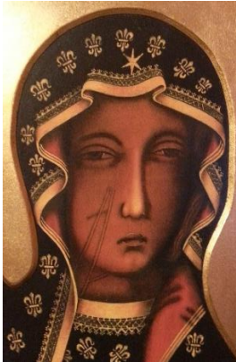
May 3: Our Lady of Czestochowa (Poland)