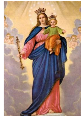
May 24: Our Lady Help of Christians