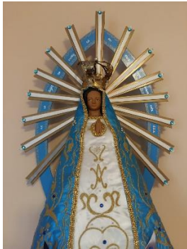
May 8: Our Lady of Lujan