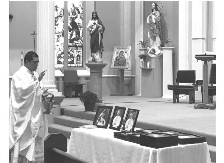
▲ distribution of St. John Paul II images at 5PM Holy Mass at Sacred Heart on Oct 22.

We thank all parishioners who are participating in praying for our Priests in the Diocese.